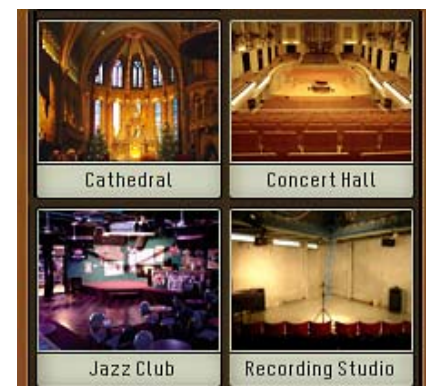
► AKOUSTIK PIANO – 4 highly distinctive environments

From the close mic setup of a jazz combo to the more ambient nature of classic solo performance, AKOUSTIK PIANO covers the whole spectrum.