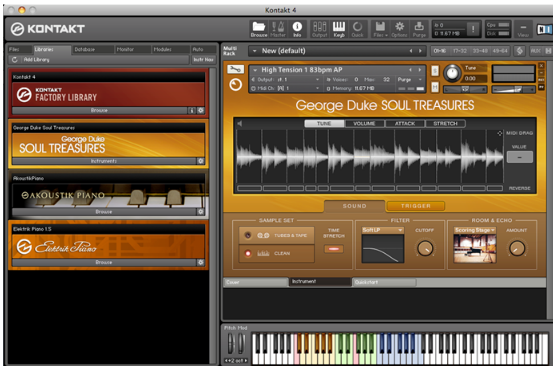
Fig. 1.1 George Duke SOUL TREASURES loaded into KONTAKT Player.

George Duke SOUL TREASURES is a KONTAKT Instrument; you will, therefore, have to have KONTAKT or the free KONTAKT PLAYER installed on your computer in order to use this instrument. Refer to the KONTAKT / KONTAKT PLAYER documentation to learn how to load and configure KONTAKT Instruments.