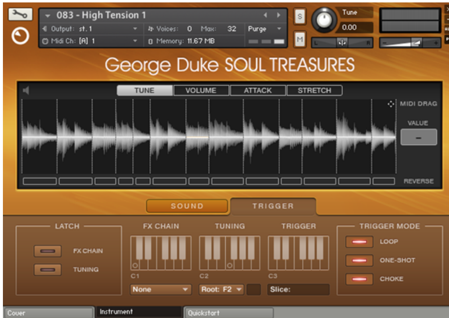
Fig. 2.2 Instrument Header with Performance View showing the Instrument tab.

And here's a short introduction to what you can do within the Performance View (find more detailed descriptions in chapter 3 , Using George Duke SOUL TREASURES ):