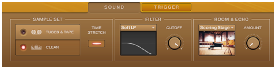
Fig. 3.2 The SOUND page and controls.