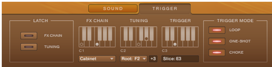
Fig. 3.3 The TRIGGER page and controls.

On the TRIGGER page, you can control how the slices, effect chain, and tuning modifier behave when triggered with a MIDI controller / MIDI keyboard or the KONTAKT On-Screen Keyboard.